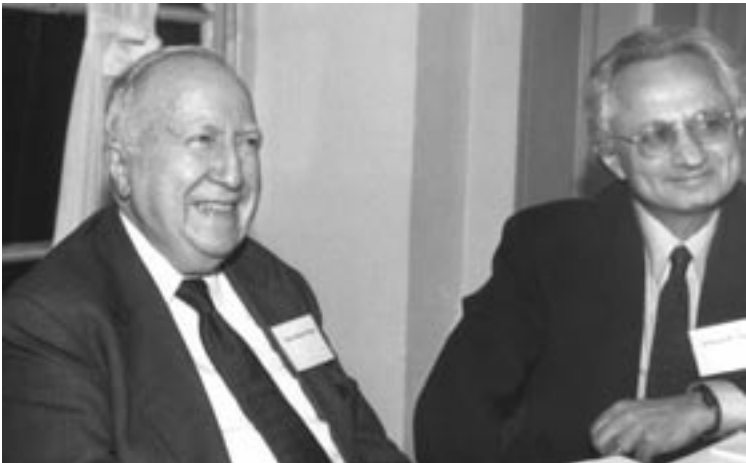
Black and white photographs by Ken Levinson