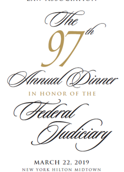
CONGRATULATORY NOTICE SPECIFICATION SHEET

THE NEW YORK INTELLECTUAL PROPERTY LAW ASSOCIATION